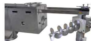
Dosing screw with drive, extracted and swivelled to the side