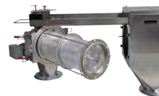
Screen basket swivelled to the side.