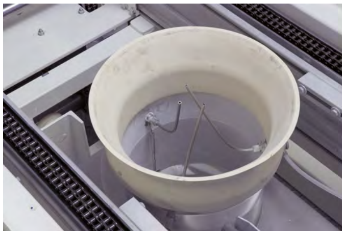
Patented docking collar with cleaning device